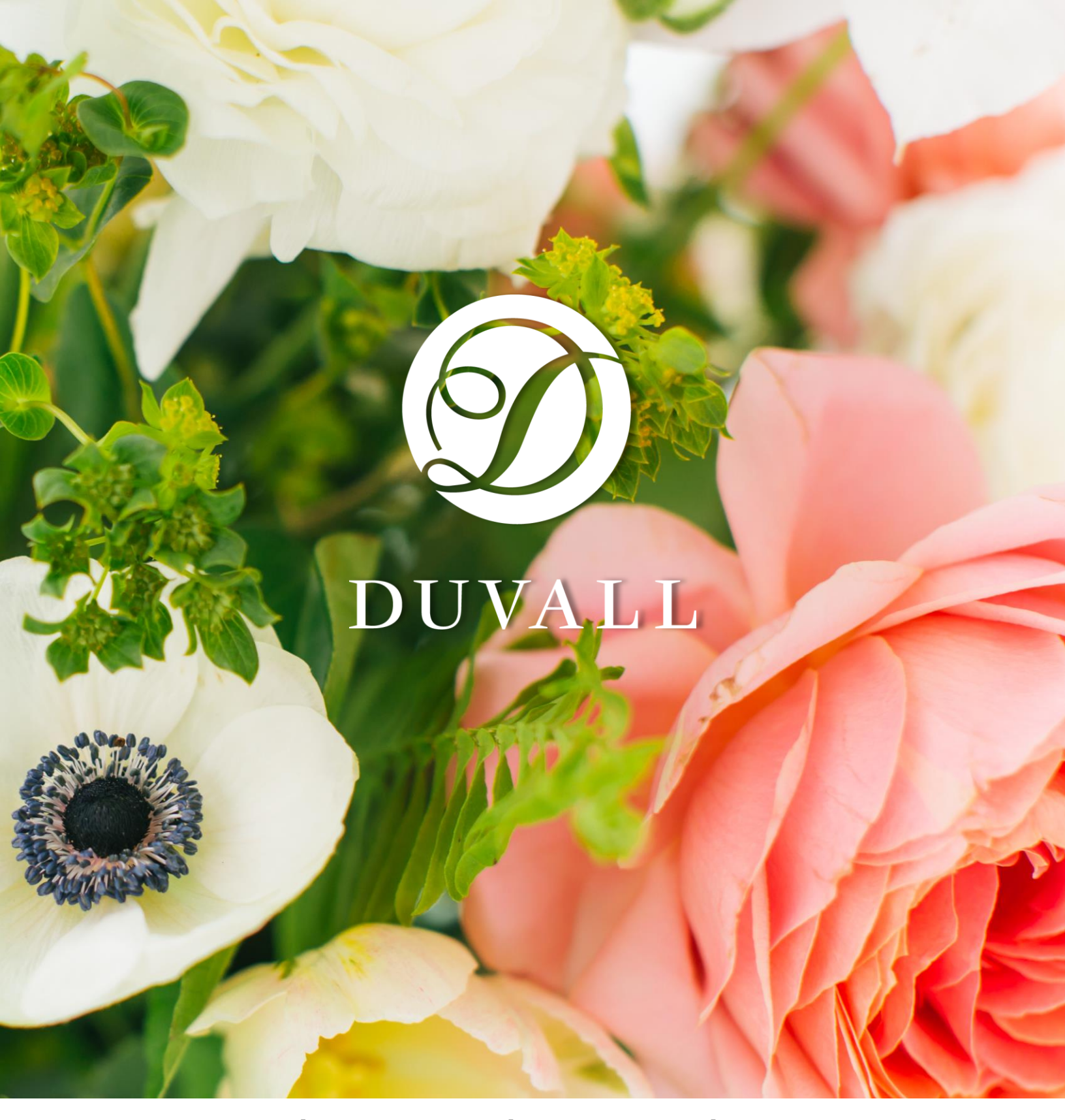
Floral | Lighting | Draping | Lounge Duvall Ploral & Décor