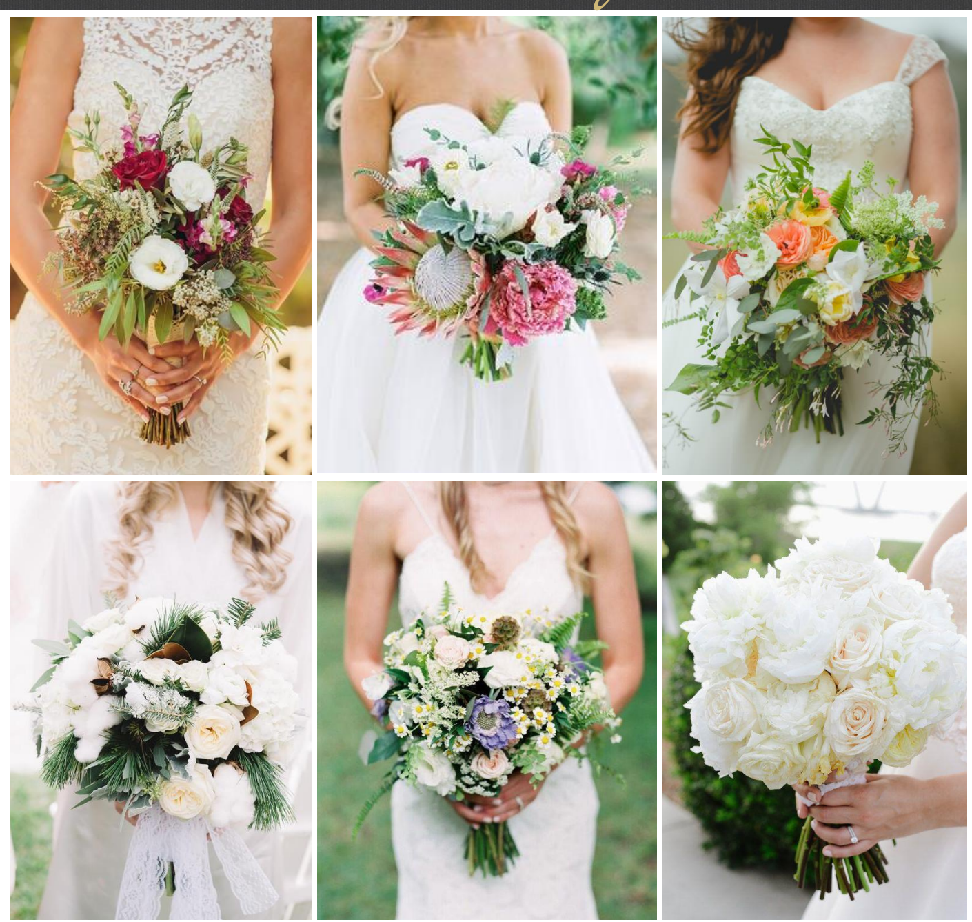
The Beautiful Blooms

Bridal arrangements are custom designed for each of our beautiful brides! The bouquets typically range from $150 - $250 depending on the style, size, & blooms.